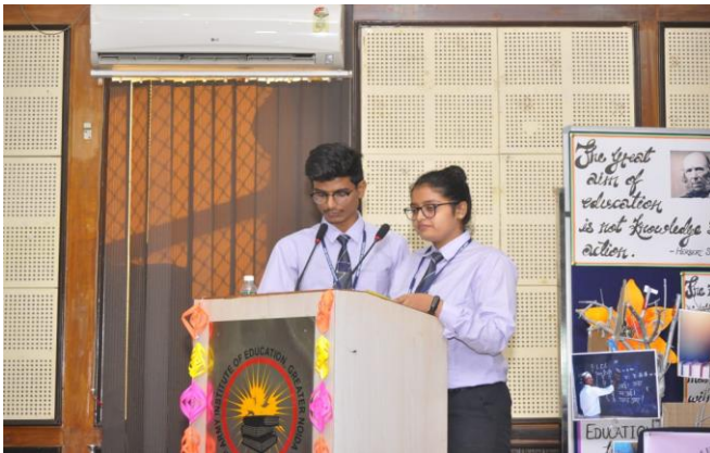
Student Teacher of AIE Batch 2019 -21 Presenting their papers