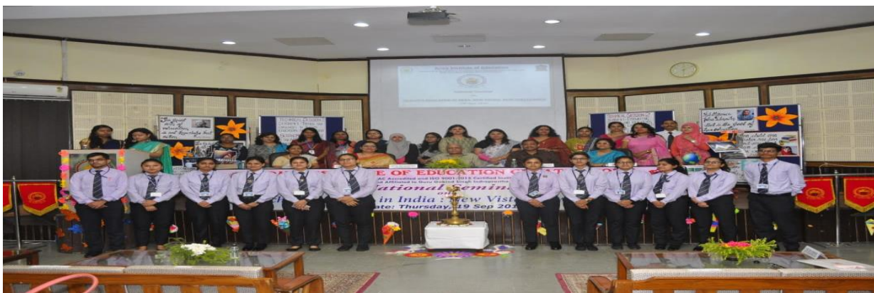
Photograph of Paper Presenters