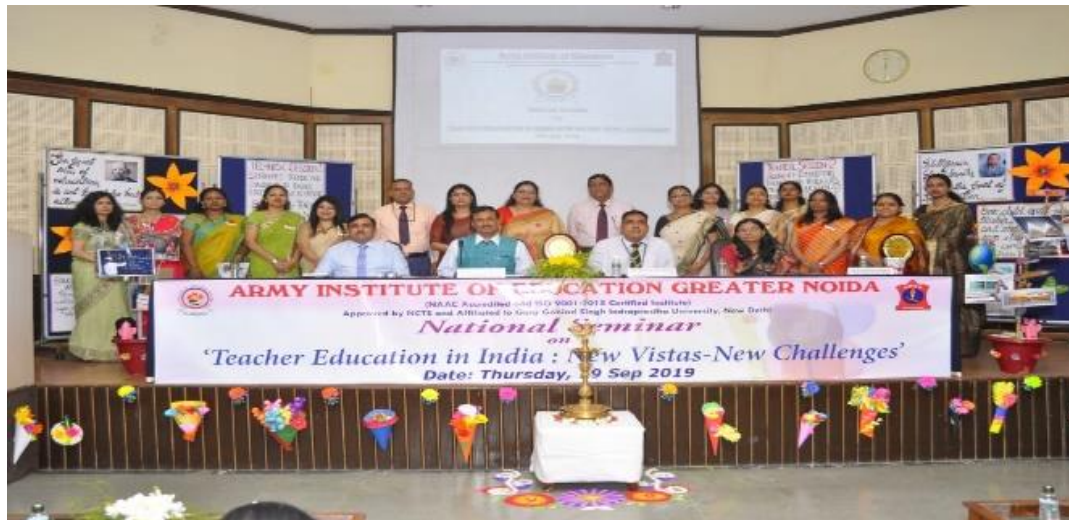
Photograph of the Guest of the National Seminar with the Faculty of AIE